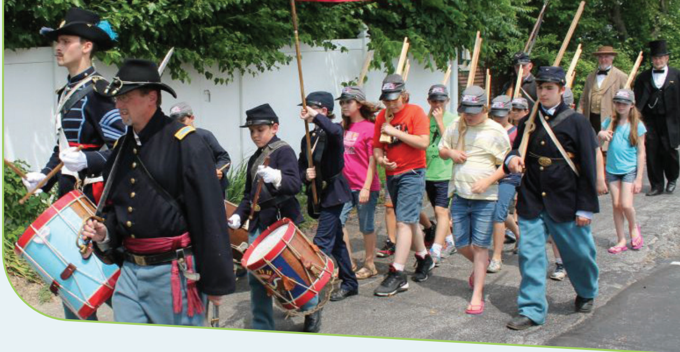
History comes alive for Whitley County youth during the Historial Museum's Civil War Camp.*