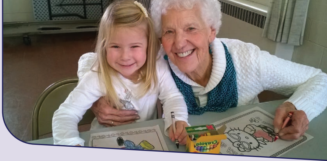
Seniors and preschoolers became pals during One Community's free lunch program in South Whitley.