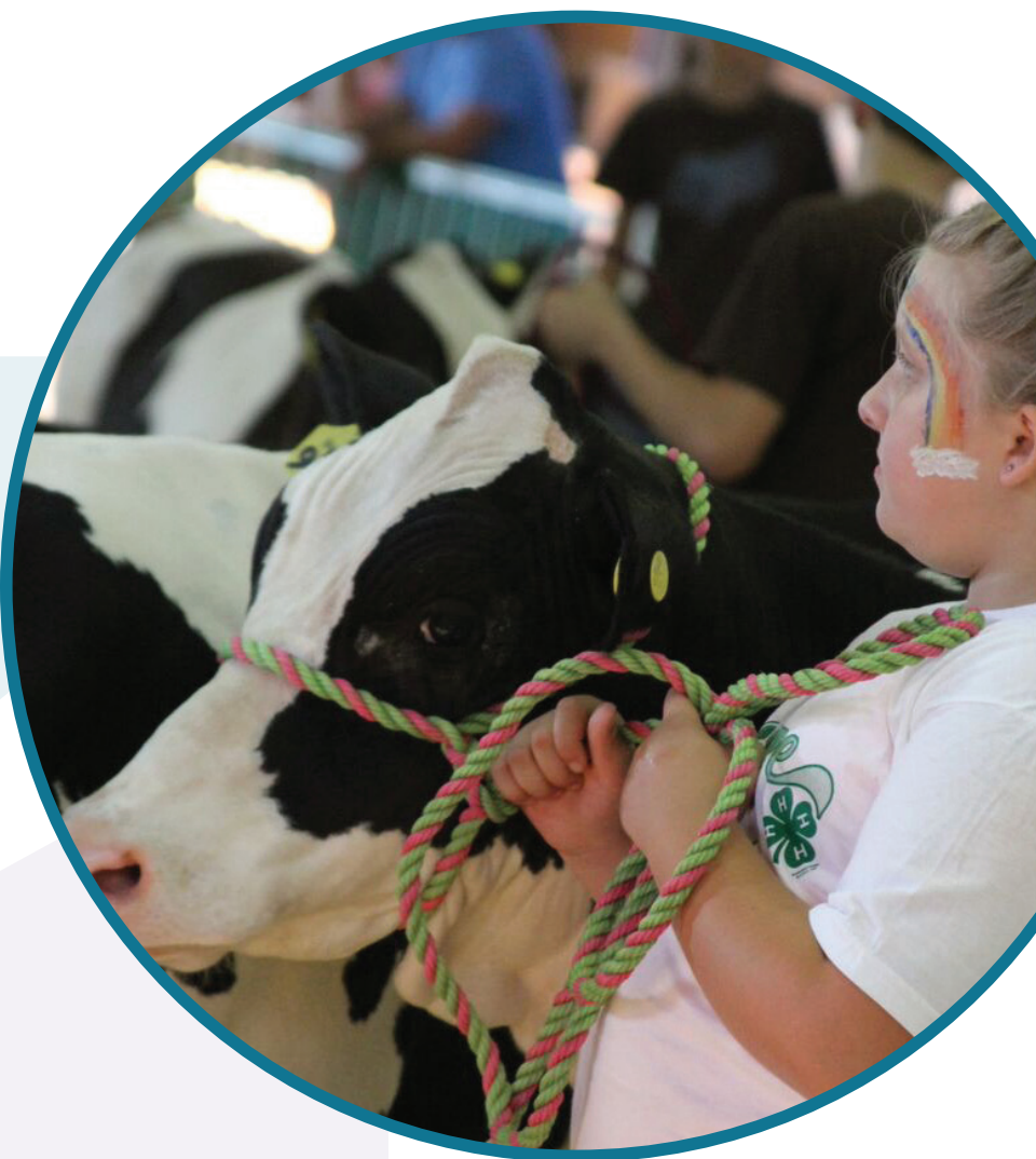
There's more to showing cows than simply walking into a ring. The 4-H Beef Club Scholarship is awarded to a deserving, college bound student each fall.*

Kenny Simon Scholarship Fund Andy Spencer Memorial Scholarship Fund Nicholas and Laurel Steill Scholarship Fund Ashley Morgan Storm Memorial Scholarship Fund Turtletown Players Scholarship Fund Ross Unverzagt Memorial Scholarship Fund Jerry Walker Memorial Scholarship Fund Vaughn Scholarship Fund Howard and Mimi Wherry Memorial Scholarship Fund Harold "Potch" Wheeler Memorial Scholarship Fund Charles White Scholarship Fund Whitley County Builders Association Fund Whitley County Retired Teachers' Association Scholarship Fund Whitko Scholarship Fund B.V. and Flossie Widney Memorial Scholarship Fund Megan Young Memorial Scholarship Fund Rely C. and Izora Zumbrun Education Fund